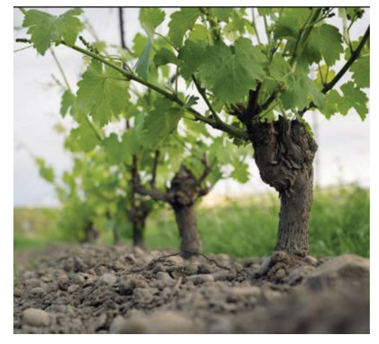
MHT Syrah at Delmas/SJR Vineyard

The soil pit at Cayuse Cailloux Vineyard is about 1 meter deep, showing the cobblestone and silty topsoil descending into more gravel-pebbly, rocky subsoil. While these cobbles heat up a lot during the day, they cool off rapidly at night, though that day time heat percolates down into the soil. Corollary to the fact of relatively lower altitude on the floor of a valley, the Rocks District periodically suffers from frost and bone-chilling winter weather which can kill buds and even kill a vine, more so than on the surrounding hillsides. Consequently, growers in the lower sections (like SJR Vineyard) bury the top part of the vine in winter, sometimes facilitated by using a low mini-head training (MHT) system they created at SJR Vineyard. (see caption)