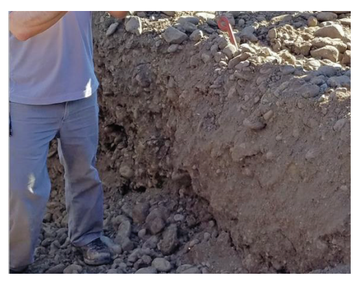
Soil Pit at Cailloux Vineyard

Nonetheless, as Kevin Pogue has noted, the cobbly highly porous soils are quite deep, up to 300', with very little top soil. In Chateauneuf du Pape's similar 'galets roulés soils, Pogue says the cobbles are only a few feet deep and sit on richer clay soils, which hold water much better. (See map and pictures). "This is one of the only places in the Northwest where you don't have to have a cover crop," he said. "You don't have to worry about the soil eroding or blowing away." (op cit. Degerman) Soil Survey of Umatilla County, Oregon, 1988.